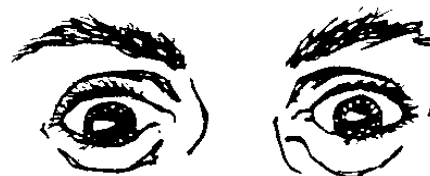
Three Whites Visible