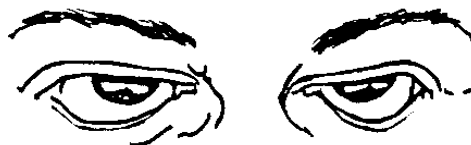
Whites Below, Half of the Iris Showing, and Glassy Eyes