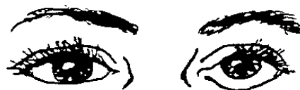
Whites Below One Iris Only